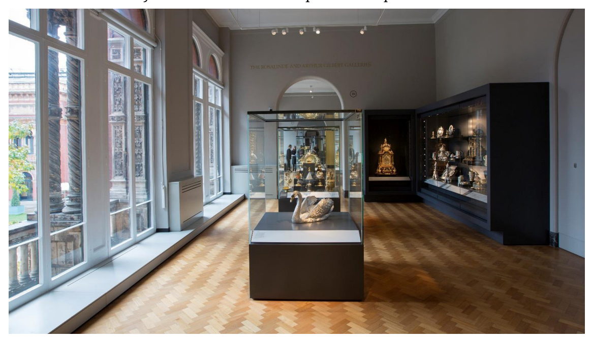
Fig.1: View of The Rosalinde & Arthur Gilbert Galleries

responsible curators such as myself, deaccessioning always represents a major challenge: It requires us to remove objects from a collection built over decades, pieces which were carefully selected by the collector. Is it the right choice? Will we come to regret this? Will this one day be seen as a lapse of judgment and will future generations condemn the decision? The pressure was high, especially in the UK environment where deaccessioning for financial gain is generally frowned upon or seen as a sign of desperation. This article provides a case study to show how this process works in practice. It is of course important to get to know the collection first. We will then turn to the legal status of the collection today before we consider the practical steps that needed to be taken.