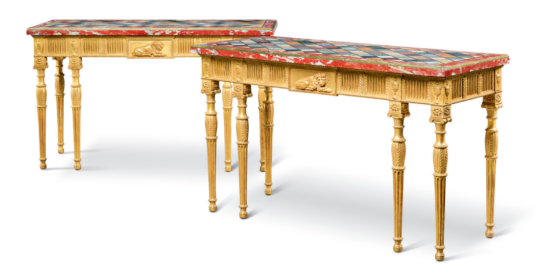
Fig.4: A pair of George III style specimen marble topped carved giltwood tables. Estimate 15,000-25,000GBP. Sold for 23,750GBP

Trust are bound to the policy of the V&A which, like any museum in England, is "to enrich people's lives by promoting research, knowledge and enjoyment of the designed world to the widest possible audience", and ensuring "that the objects are exhibited to the public"<sup>11</sup>. Each object is important, has information to reveal and ought to be accessible to visitors. Therefore, Gilbert trustees cannot simply alienate objects arbitrarily and must follow the appropriate guidance provided in the United Kingdom, by the "disposal toolkit by the Museum Association".