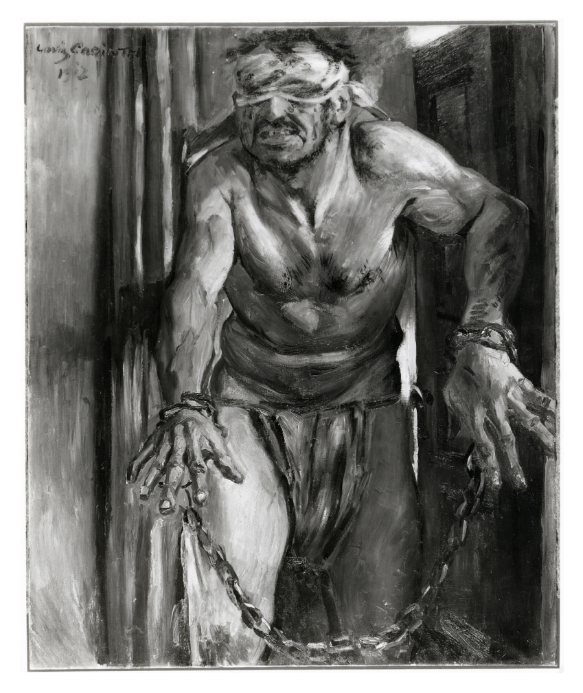
Fig. 1: Lovis Corinth, Samson Blinded, 1912, oil on canvas, inv. no. A III 668.