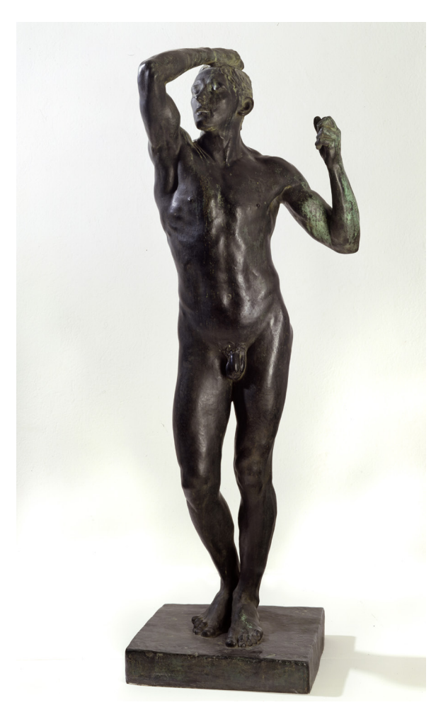
Fig. 3: Auguste Rodin, The Age of Bronze, 1875/76. Staatliche Museen zu Berlin, Nationalgalerie.