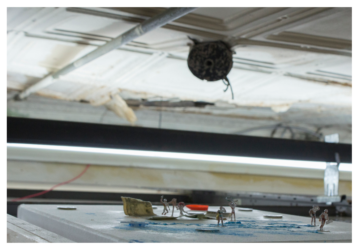
Figure 2: Installation View, N Figure 2: Isa Genzken, Untitled, 2014, spray-paint, coins, plastic, dollar bill, National Gallery at Grand Century. Available at National Gallery, accessed August 28, 2017, http://www.grandcentury.biz/nationalgallery.html.

tioned. Isa Genzken's work was, for example, installed along all other works in the exhibition National Gallery on a metal construction of a lowered ceiling which was removed and replaced by plexi glass. The work, two small paintings with coins, a ripped dollar bill and miniature plastic figures glued onto it, could be accessed with ladders that allowed the audience to climb to the ceiling and view the exhibition from both the floor looking up and the ceiling looking down (see Figures 1 and 2).