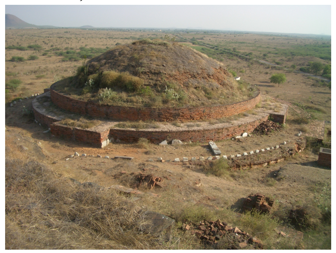
Fig. 2: The exposed Chandavaram St\bar{u}pa as seen from the north, the hemispherical dome almost intact, northern and western \bar{a}yaka -platforms clearly visible protruding from the drum, Chandavaram, Andhra Pradesh, India, 6 January 2004

in his Masters Thesis to make it more accessible to scholars. In the process the discouraging discovery was made that a great number of reliefs had been stolen from the site museum in the early 2000s.<sup>27</sup>