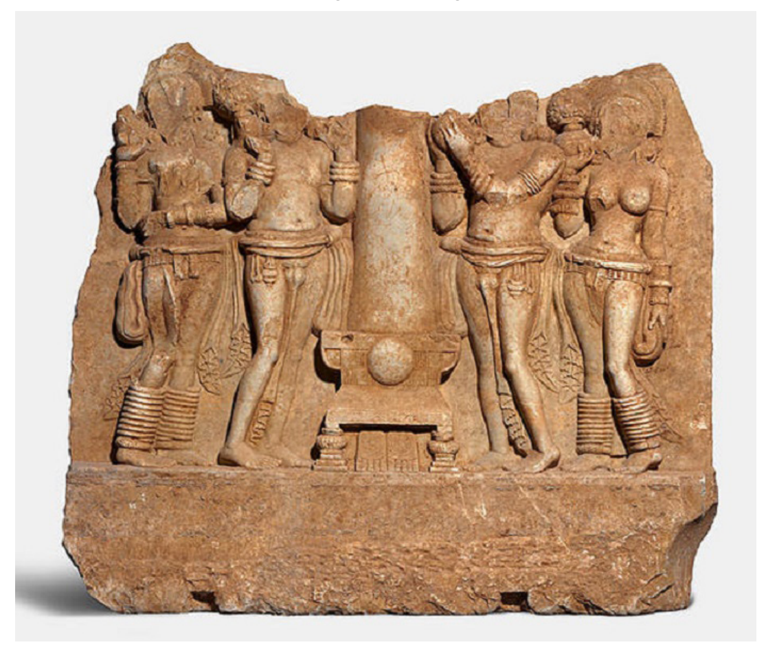
Fig. 1: Chandavaram, Andhra Pradesh, India, Worshippers of the Buddha , 2nd century BC–2nd century AD, limestone, 96.5 \times 106.7 \times 12.7 cm; when in collection of the National Gallery of Australia, Canberra, accession number 2005.229; presently on display in the National Museum, New Delhi

September 2016, the NGA returned the panel to India after art historian Robert Arlt alerted the Gallery to its archaeological origin and evidence that it was taken from the small under-resourced Chandavaram site museum, probably in the early 2000s, and illegally exported from India. This paper documents the true history of Worshippers of the Buddha , reconstructed from meagre archaeological and museum records. It then