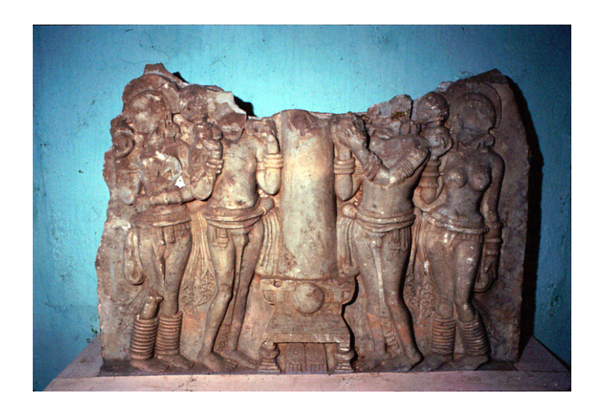
Fig. 5: Image of the Chandavaram panel matching Worshippers of the Buddha on display at the Chandavaram site Museum before it's closure in 2001.

Recently a panel that was featured in one of Kapoor's catalogues was seen in a branch of the Louvre in Abu Dhabi (fig. 6).<sup>37</sup> Given that Kapoor was arrested in 2011 and his dealings have been publicly questioned, it seems surprising that this museum, which opened on 11 November 2017, would knowingly showcase a piece like this.<sup>38</sup> Its iconography is similar to that of many sites in Andhra Pradesh. Two similar reliefs have recently been found in the bed of the Gundlakamma River near the Chandavaram St\bar{u}pa ,<sup>39</sup> and it is possible that the Louvre panel was taken from this or a similar site.