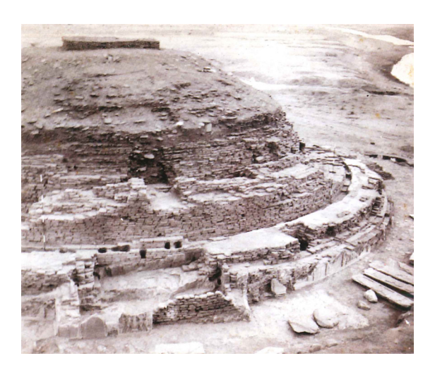
Fig. 4: Chandavaram Stūpa as seen from the north. Worshippers of the Buddha in situ decorating the northern āyaka 's frontside. Photograph taken after 1972 during the excavations. From Subrahmanyam, B. / Reddy, E. S. Buddhist Archaeology in Andhra Pradesh, Hderabad: Department of Archaeology and Museums Andhra Pradesh, 2008: 28.

depicted in each of the photographs allowed Worshippers of the Buddha , an item from Kapoor's inventory, to be confidently identified as the missing panel that was originally from the main st\bar{u}pa at Chandavaram. Thus, Arlt contacted NGA provenance researcher Lucie Folan on 4 April 2016 and on 8 April provided her with two images of the relief in situ at the st\bar{u}pa 's northern \bar{a}yaka -platform as evidence that Worshippers of the Buddha had been excavated in Chandavaram during one of the 1970s' campaigns (figs. 2, 4).<sup>34</sup>