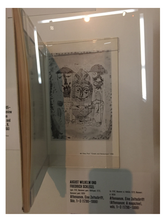
Fig. 2: Catalogue of the exhibition German watercolors, drawings and prints; a mid-century review, with loans from German museums and galleries and from the collection Dr. H. Gurlitt on display.

of wheels within wheels", as stated on the first page of another seminal historical document exhibited next to the Wiesbaden Manifesto: a preliminary report on the Buchenwald concentration camp written by Edward Tenenbaum and Egon Fleck. They had been the first Americans to enter the camp after the German retreat in April 1945, and described a terror that was multi-focal, driven by the Nazi administration and unfurling across rivalries between various groups of inmates. History was then staged as a set of overlapping power shifts and the focus on the circularity of violence elicited reflexivity rather than relativism.