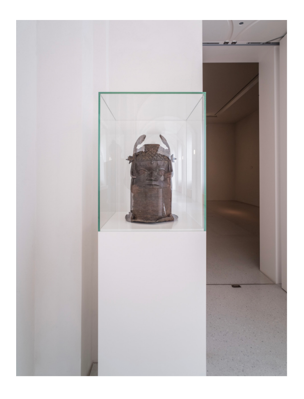
Fig. 3: A king's head from Benin, erroneously captioned as an "a queen mother, uhumnw-ea-lo (Edo, Benin Empire, ca. second half of the nineteenth century)".

To my knowledge, this is the first time that such objects have been presented as part of a contemporary art exhibition. The two Benin head and a relief plate made of brass, dated from the eighteenth and nineteenth century, were juxtaposed with a coeval group of eight female marble figures representing the most prominent art nations in Europe, by the German sculptor Carl Echtermeier (1845-1910), and alongside the collages and sound installation by the Hungarian poet and performance artist Katalin Ladik (1942-), one of the leading figures of the Yugoslavian neo-avant-garde in the 1970s (fig.5).