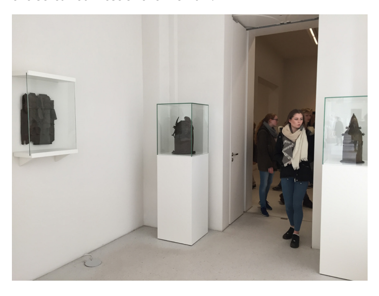
Fig. 4: Figurines from Benin on display at documenta 14.

Old Masters collection of the Hessian landgraves, "coincided with the heady early days of the German empire. Its phalanx of eight marble Länderfiguren in particular [...] speaks to the entanglement of nationhood, institution building, and cultural politics in this triumphant moment soon after modern Germany's emergence from the Franco-Prussian War".<sup>33</sup> In combination with an impressive cycle of wall paintings by Carl Gottlieb Merkel (1817-1897),<sup>34</sup> the sculptural display of the museum framed the presentation of the actual artworks with a figurative art history, a set of visual narratives on the major art schools and leading masters, illuminating the ideals and dominant categories of a thriving art history, a major institution of cultural politics during the German Empire. Curiously, instead of revisiting this institutional framework of knowledge-power production in the accompanying caption, the group was presented as an isolated work conceived upon the artist's initiative: "From 1876 to 1882, the German sculptor Carl Friedrich Echtermeier (1845-1910) took upon himself the duty of producing a series of sculptures entitled "Länderfiguren" (National figures) [...] Echtermeier's attempt was to create the canon par excellence. What Echtermeier left out of his equation was the arts of the so-called 'rest of the world".35